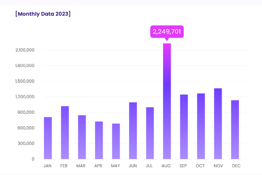
Phishing statistics by month showing august increase

1. Attackers are most active in August: The period from September to November has been identified as some of the busiest months for phishing attacks, coinciding with the onset of the holiday shopping season. Bolster research has found that the three months leading up to the holiday season in December account for 20% of all phishing and scam activity for the entire year of 2023. That said, August of 2023 recorded a record high of 2.2M unique malicious websites when many Americans are off on summer vacation.